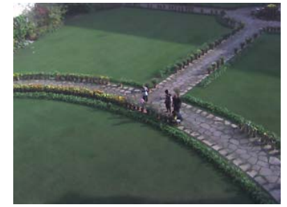
The view from my balcony.

Ramakrishna Mission Institute of Culture. December 27, 2005.